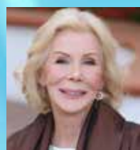
LOUISE HAY, Founder Hay House

The Writer's Workshop also includes an exclusive, rare opportunity for you to view videos from Hay House best-selling authors as they share their writing experiences, including: